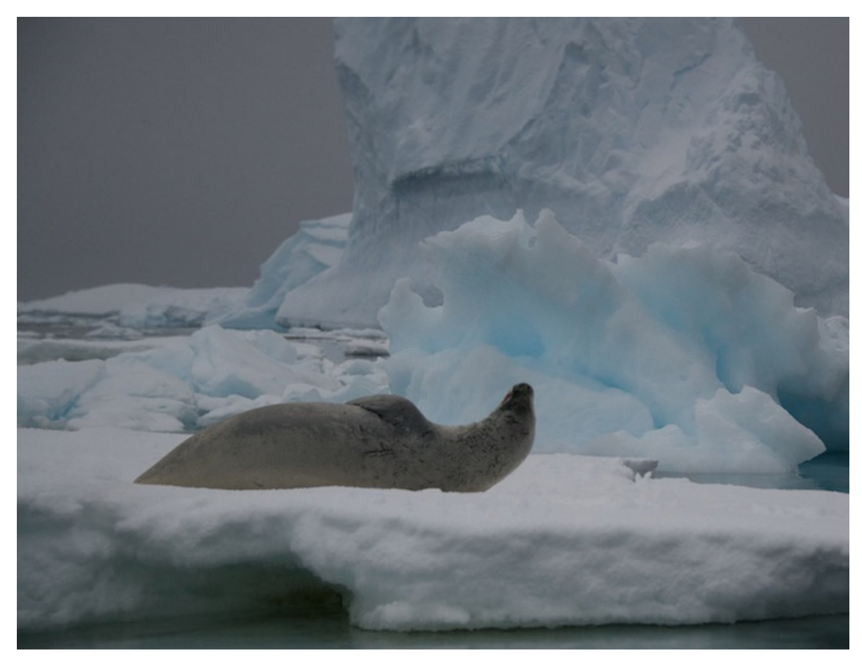
Seal, Pleneau Bay, Antarctica, December 2018