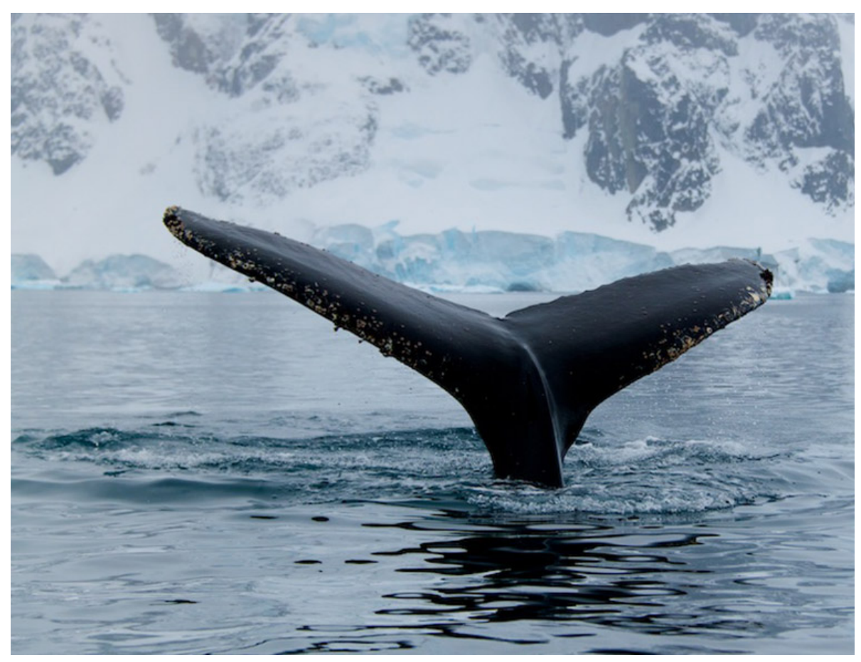
Whale, Gerlache Strait, South Shetland Islands, Antarctica, December 2018