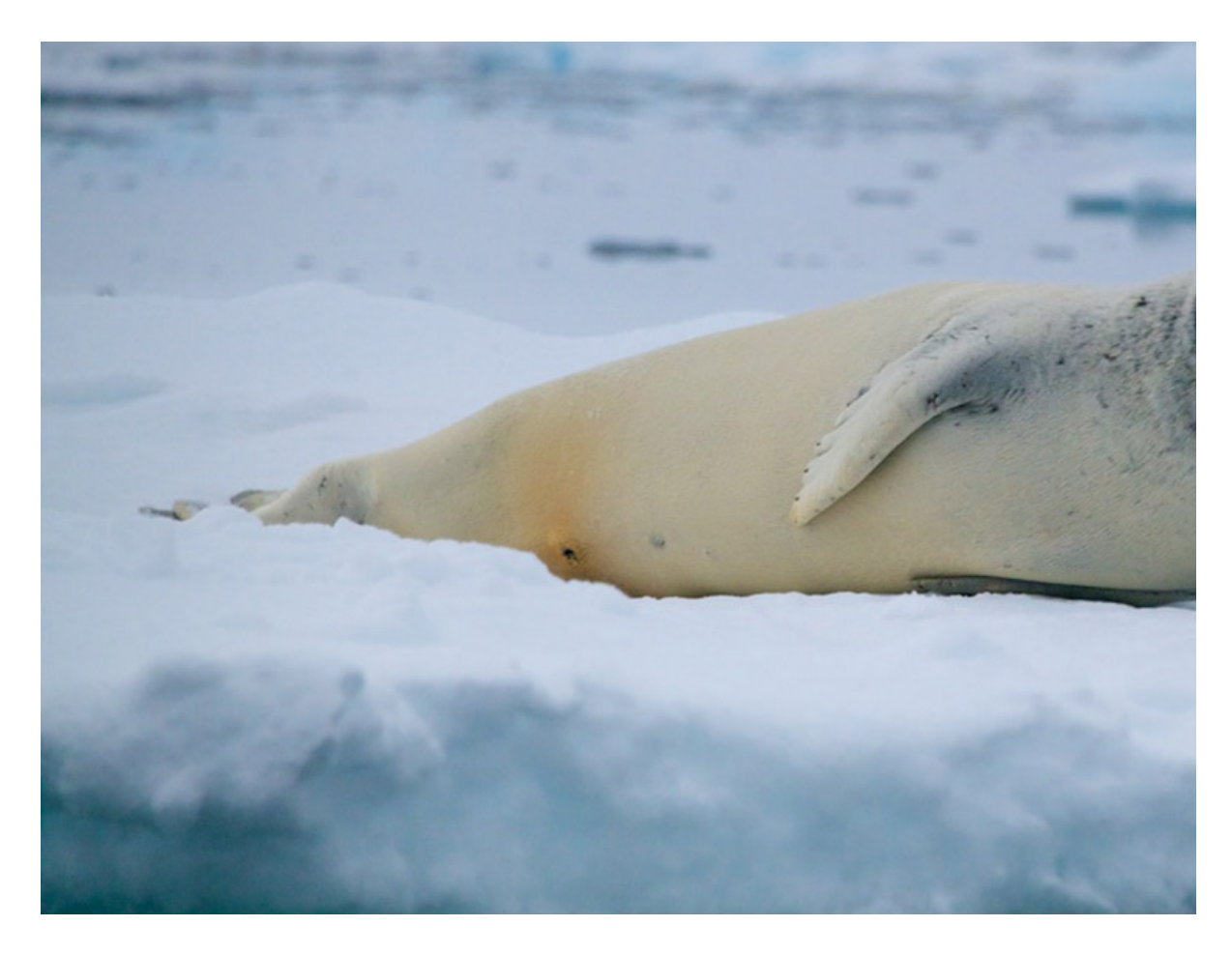
Seal, Pleneau Island, Antarctica, December 2018