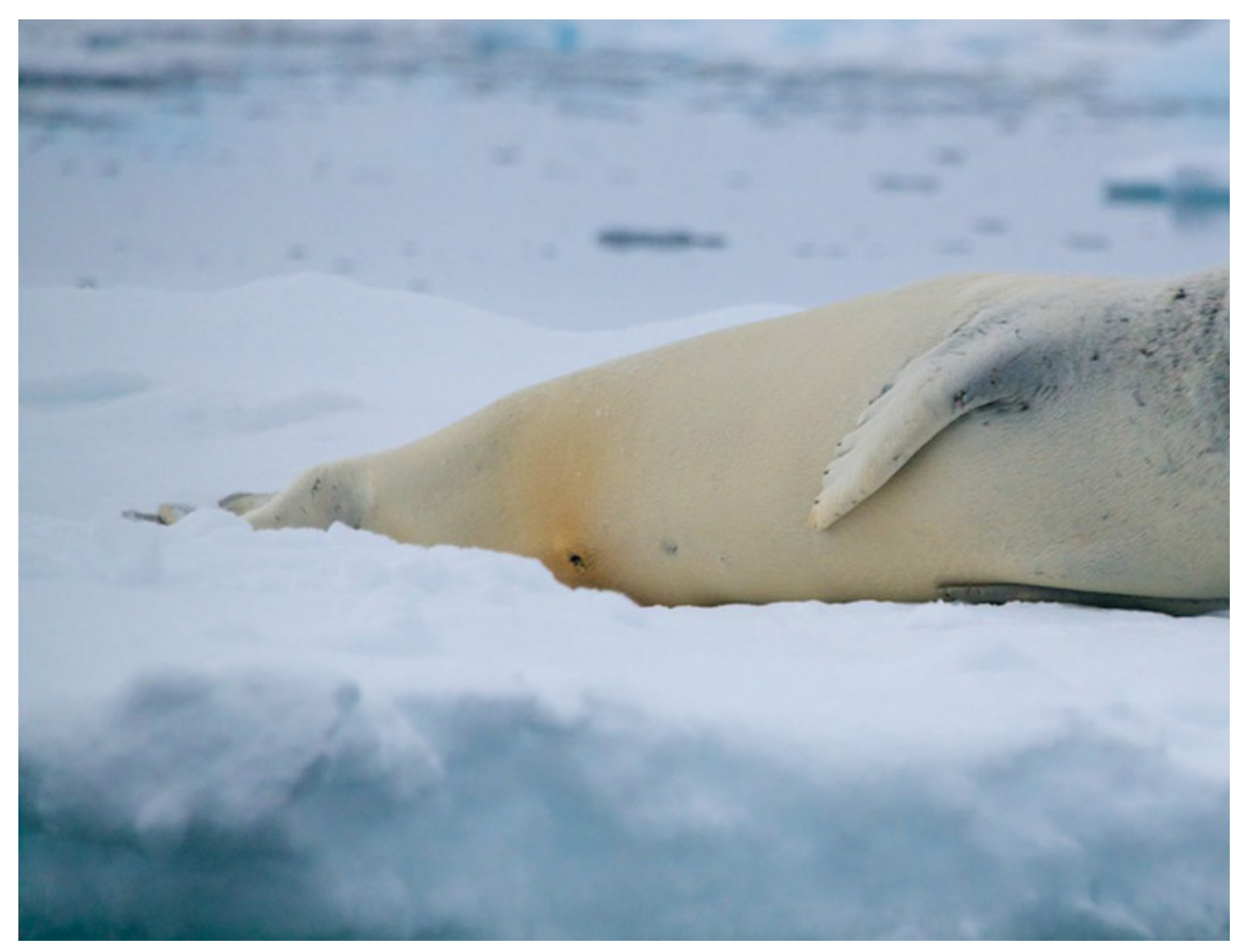
Seal, Pleneau Island, Antarctica, December 2018