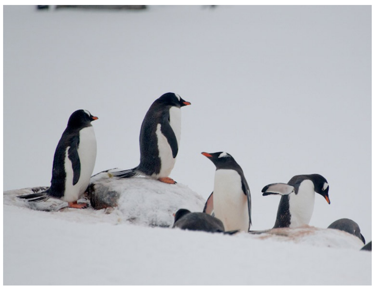
Penguins, Pleneau Bay, Antarctica, December 2018